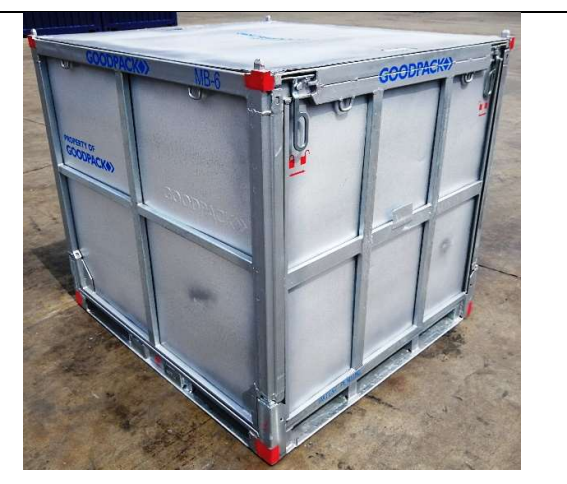
Container fully setup with lid in place