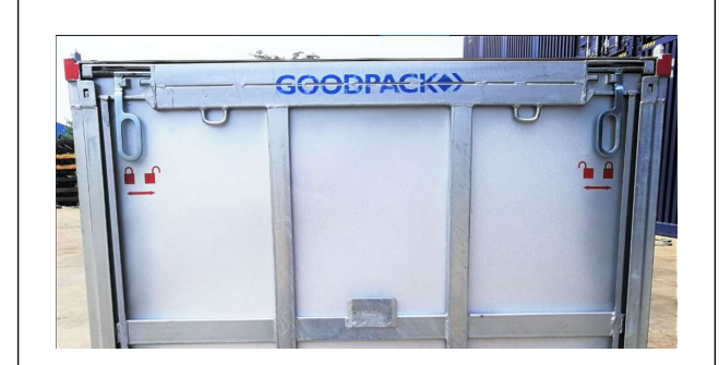
Close-up of locking latch with handle